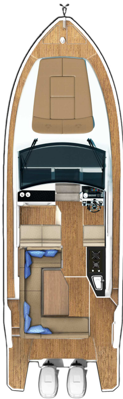
MAIN DECK with extended bathing platform