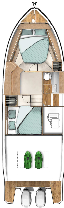
LOWER DECK standard