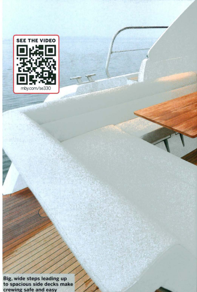
Big, wide steps leading up to spacious side decks make crewing safe and easy