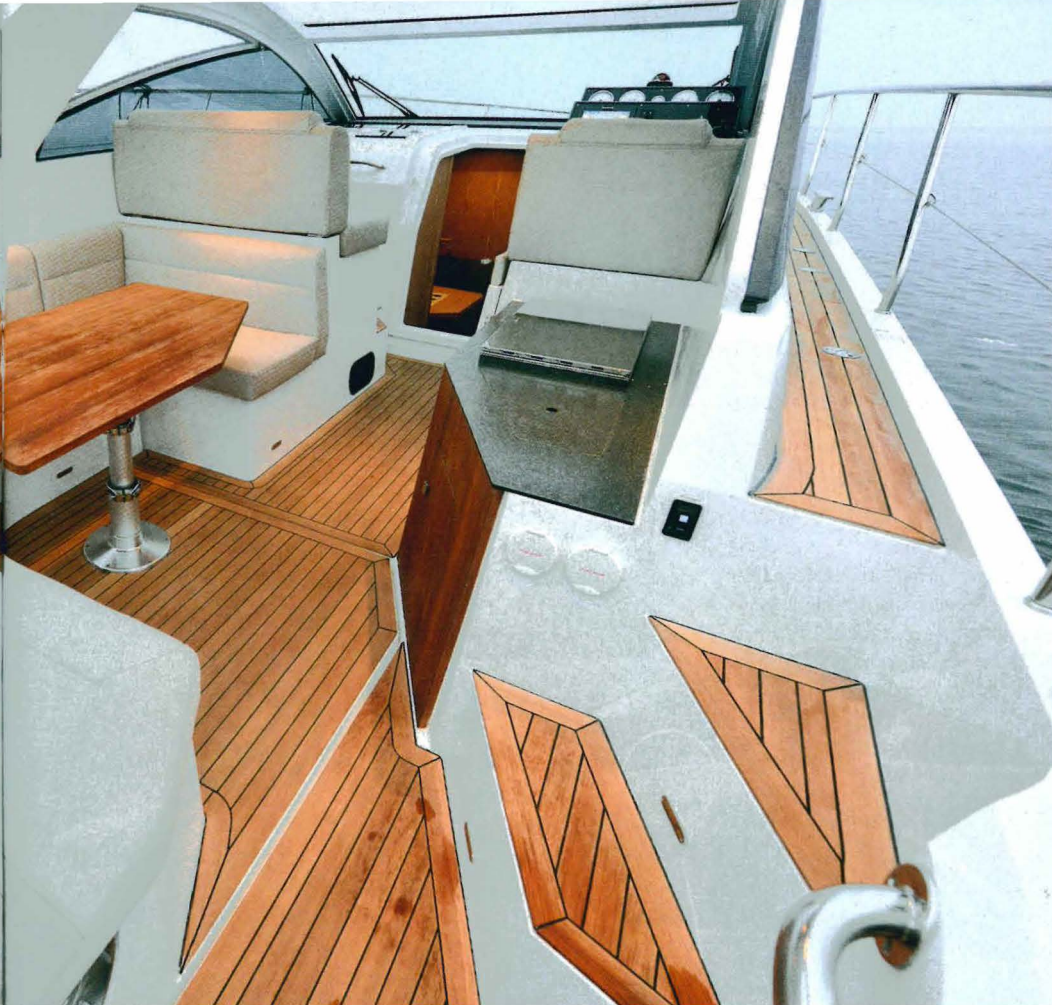
The double seat adjacent to the helm is a brilliant spot for guests to sit during a journey