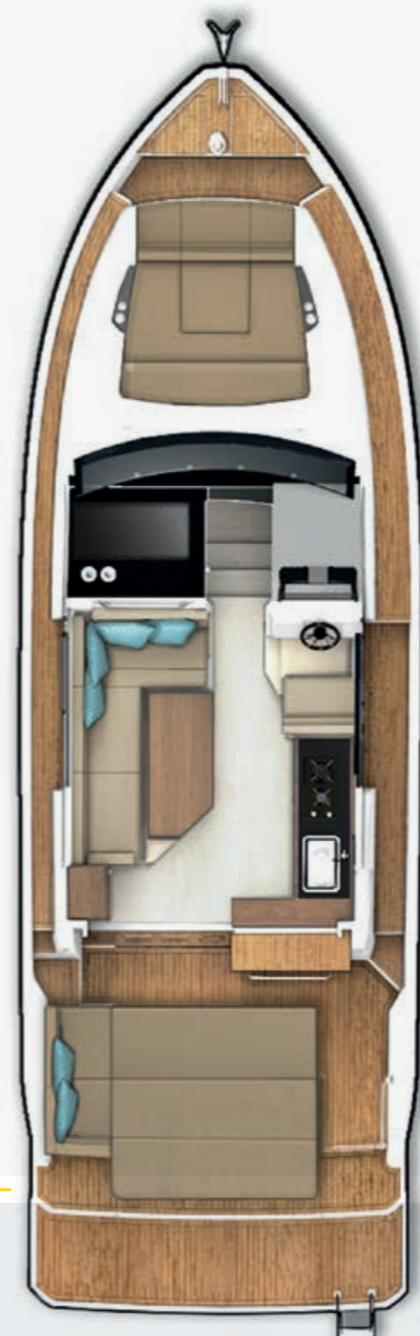
MAIN DECK option with cockpit table to be transformed into sunpad and extended bathing platform