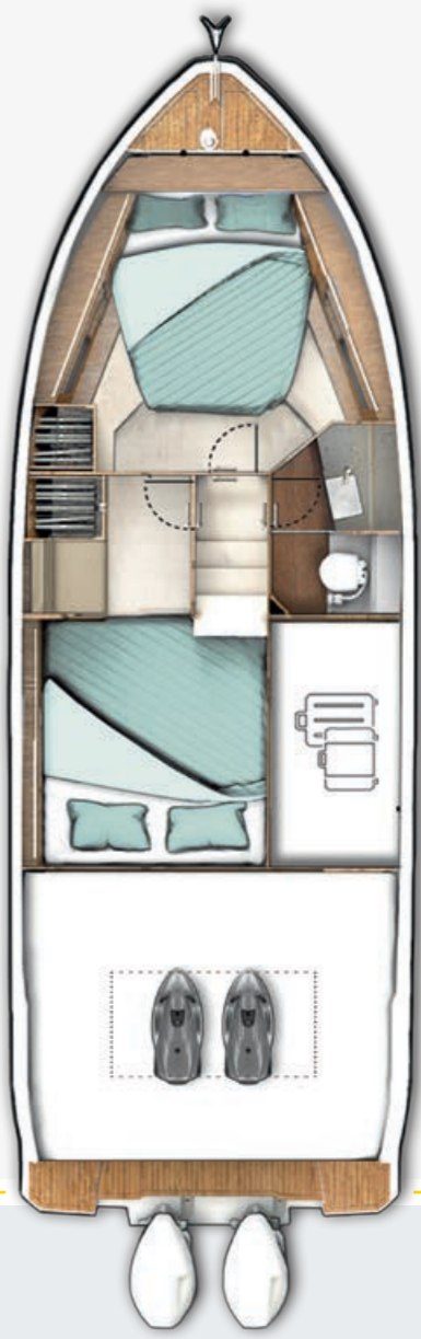
LOWER DECK standard