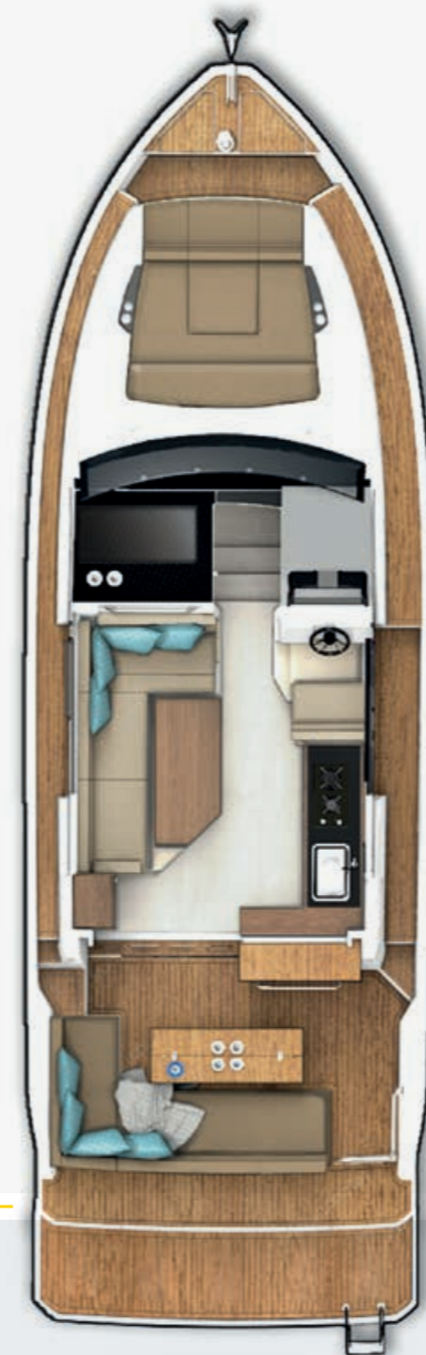
MAIN DECK option with fixed cockpit table and extended bathing platform