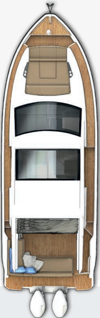
MAIN DECK ROOF standard