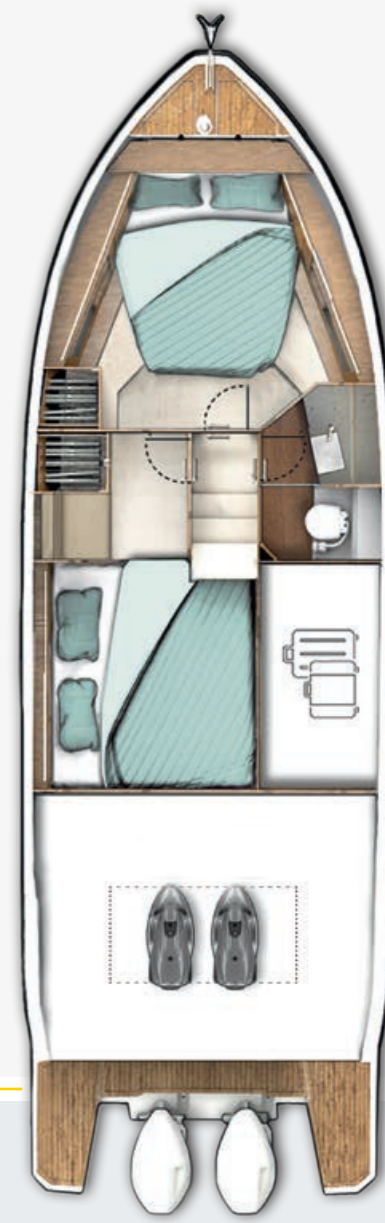
LOWER DECK option with extended bathing platform