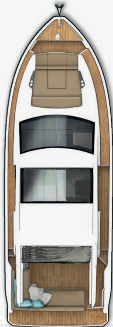
MAIN DECK ROOF standard